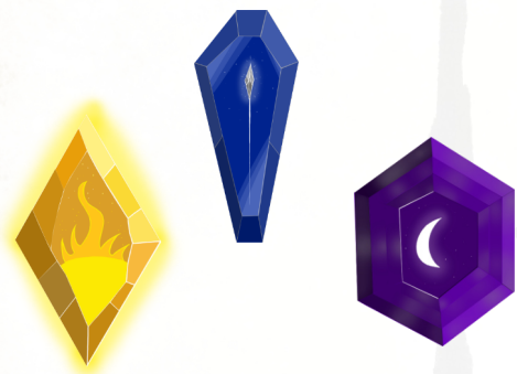
Sunspirt, Starheart, Moonsoul crystals. Often crafted from crystals found in the West Feran Mountains close to the Owl flock flocknest of Strikota.

When an owlet hatches the time of the day of hatching has traditional importance to an owl flock. If an owlet hatches during the daytime he or she is referred to as a Sunspirt; a determined avian that is eager, spontaneous and brave. A night-hatched owl is called a Moonsoul; these owls are known to be quiet, intelligent and perceptive. A Starheart, an owl that is born during the time of dawn or dusk are said to be peaceful, empathetic and careful with their thoughts and actions. The level of belief in the accuracy of this tradition can vary but every owl aarakocra knows of their birth sign. They will always keep it in mind out of respect, when speaking with flock elders or out of superstitious beliefs when out in the world that can guide their actions.